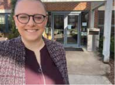
I visited Swarthmore Borough to chat with the borough manager about ways my district office can support the community.