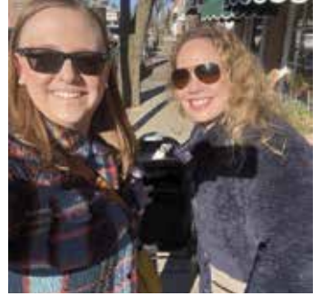
Every year on Small Business Saturday, I finish up my Christmas shopping at our area's incredible locally owned businesses. We're fortunate to have such a vibrant small business community!